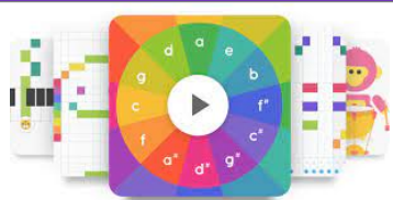
Chrome Music Lab