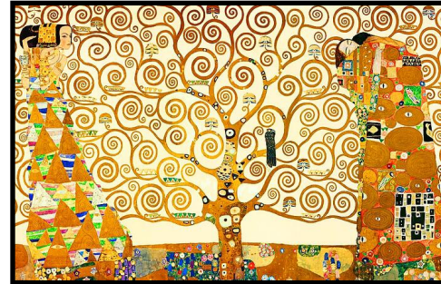
Gustav Klimt (1862-1918) was an Austrian artist known for his painting, murals and sketches.

He was involved in several artistic movements including: Symbolism, Art Nouveau and the Vienna Secession.