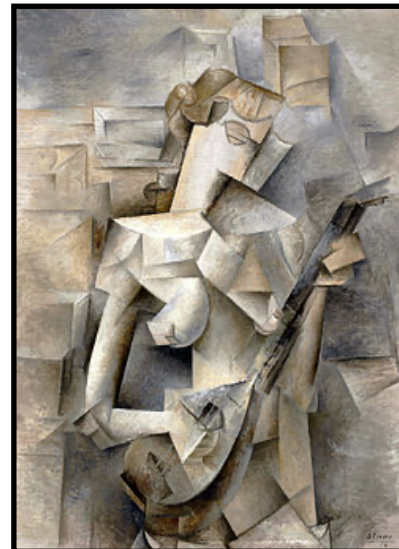
Some of his most recognisable works are cubist (part of the Cubism movement) paintings.