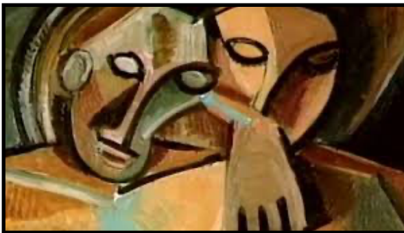
Pablo Picasso (1871-1973) is known for many different styles including: modernism and post-impressionism.