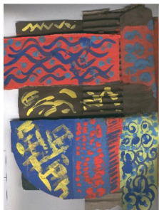
Painting on different surfaces

The primary colours are red, yellow and blue; you cannot mix these yourself. By mixing primary colours, you make secondary colours - green, orange and purple.