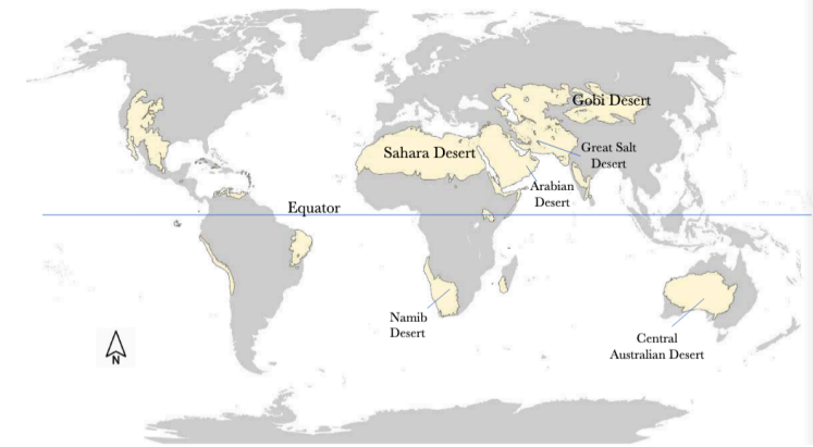
Deserts across the World

Humans can cause desertification through overgrazing and overfarming. This is when too many crops are grown on land or too much is eaten by animals. This causes the land to dry out.