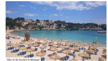
One of the beaches in Majorca.

One of the earliest holidays for lots of people was to visit the seaside closest to where they lived. This created more jobs and made the areas more money.