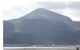
Slieve Donald, Northern Ireland