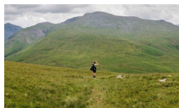
Scafell Pike, England