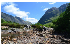
Ben Nevis, Scotland