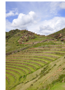
Terraced farming, Peru