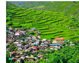
Rice fields, Philippines