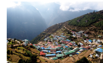
Village on the slope of the Himalayas