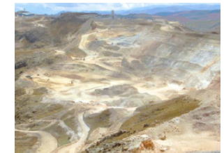
Copper and tin mines, Peru