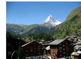
Hotels in the Alps for tourists