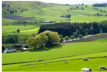
The countryside has lots of fields.