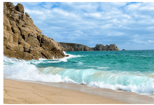
Cliffs are steep and rocky.