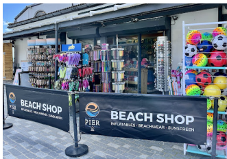
People build shops to sell things.