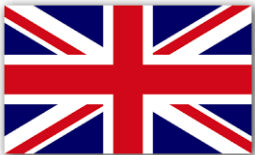
The Union Flag of Great Britain

An island is a small body of land surrounded by water.