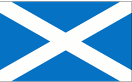
Flag of Scotland