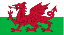
Flag of Wales