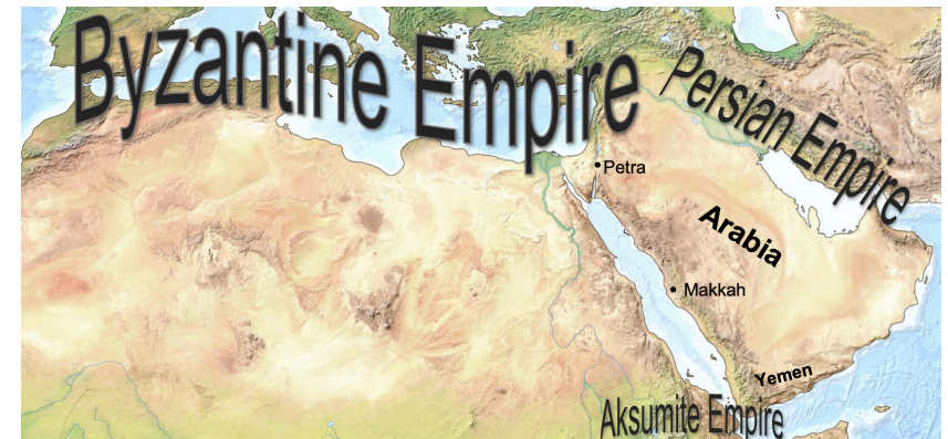
Image showing the Christian king of Aksum protecting Muslim refugees