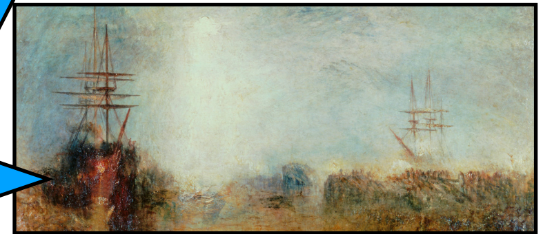
A painting by J.M.W. Turner

John Constable, J.M.W. Turner and Vincent Van Gogh are very famous artists, recognised particularly for how they painted the sky.