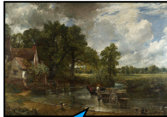
A painting by John Constable