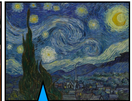
A painting by Vincent Van Gogh