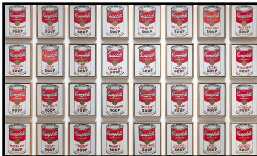
Andy Warhol's 'Campbells Soup' and 'Jagger' portraits

Andy Warhol selected this image of Campbell's Soup because it was a popular choice for his lunch.