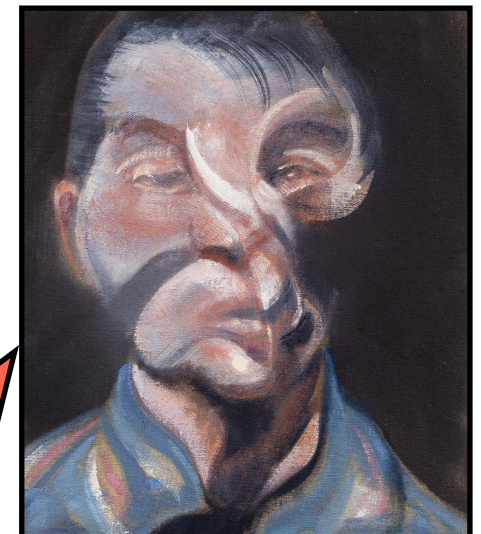
Francis Bacon's work shows distorted facial features. Bacon used photographs and film as a starting point for these distortions.