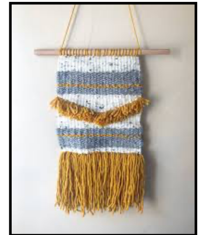
fabric wall hangings

You can wrap and knot fabrics to give them different textures.