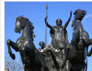
Statue of Boudicca in London