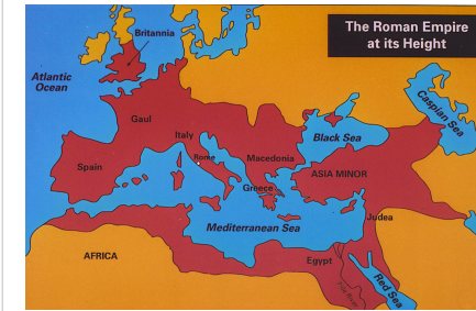
The Roman Empire at its largest - the empire spanned Africa, Asia and Europe