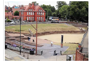
Roman amphitheatre in Chester

509 BC Tarquin banished from Rome, Rome ruled by senate