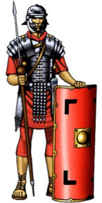
A Roman soldier