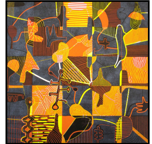
Belinda King combines screen printing, calligraphy, etching and relief printing