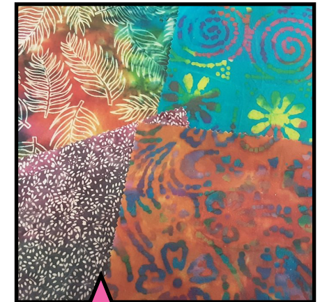
an example of batik - we use a tjanting to pour 'the resist' (hot wax) and then dye the fabric, leaving these patterns.

We are going to use 'punchinella' to design our own woven pieces, taking inspiration from the North American Indian beadwork (pictured above).