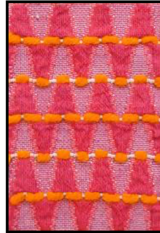
an example of twig loom weaving

To weave is to form fabric by interlacing long threads passing in one direction with others at a right angle to them.