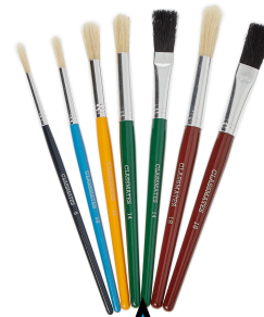
hog hair paintbrushes