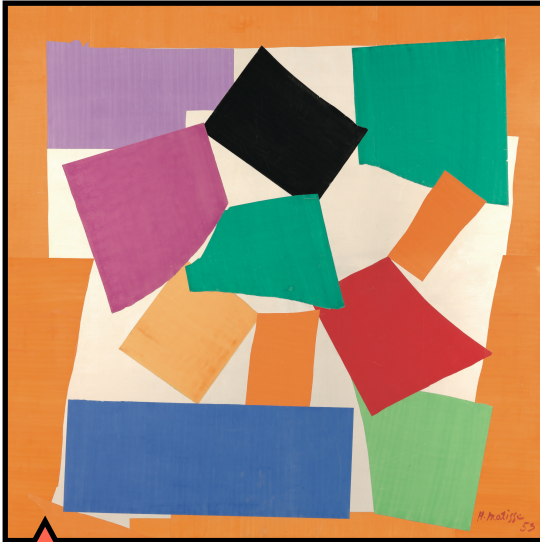
'The Snail' by Henri Matisse use cut and torn pieces of card, arranged in complementary colours. It is enormous, measuring 2.88m by 2.87m.