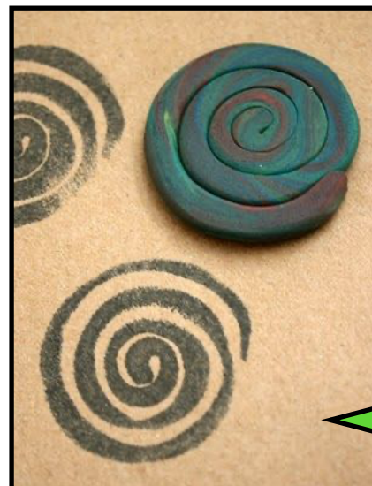
You can print with plasticine! You ink it up with a paintbrush and then press your shape to the paper.