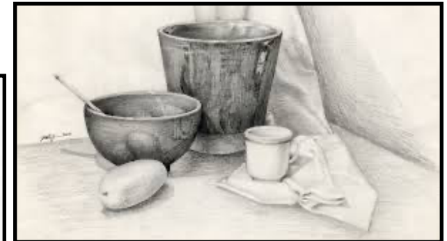
Graphite scale - B (black, soft), H (hard)