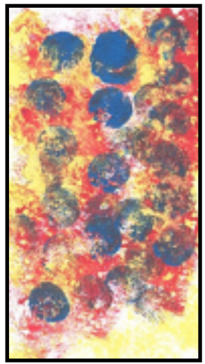
Printing with a paper towel, sponge and cork in primary colours