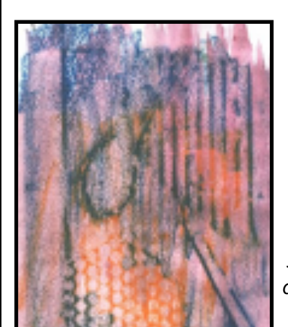
We are going to make negative prints (the empty shape) and positive prints (the coloured shape) by creating our own stencils.