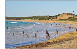
A beach in Scotland