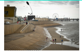
A seaside resort in Blackpool