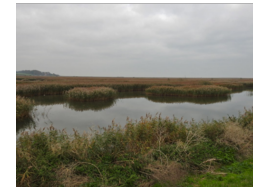
Salt marshes in Norfolk