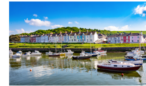
A harbour in Wales