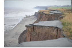
Cliffs in Northern Ireland

Coastlines are different throughout the UK.