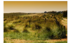
Sand dunes in Suffolk