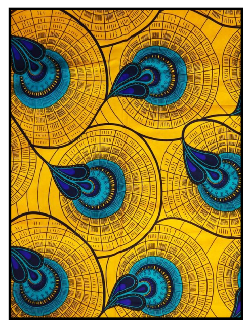
These are examples are traditional African designs that you may find printing on different textiles.

To make our prints, we use polystyrene sheets, pencils to indent, printing ink and a roller.